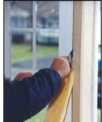
7-b: Insulate between Windows and Frame