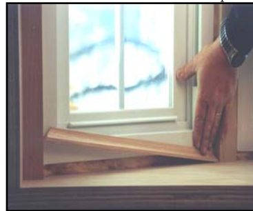
7-c: Install Interior Window Stops