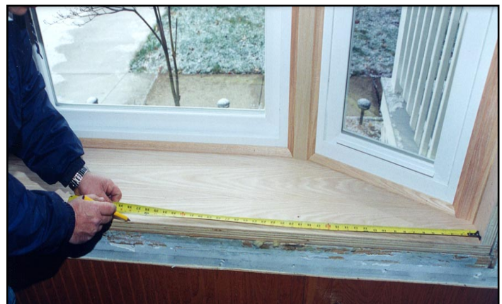
10-e: Measure and Mark Center of Frame and Bottom Face Board

Note: 3-1/2" Colonial Casing is available Pre-mitered. If ordered Pre-mitered the side pieces will be cut 1/4" short, thus dropping the top piece down past the head by 1/4" and creating a perfect sight line.