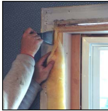
6- Insulate around frame