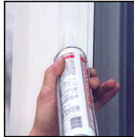
Seal Exterior of Window Units to Frame Window Stops