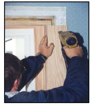
10-g: Sides are pre-cut 1/4" short!