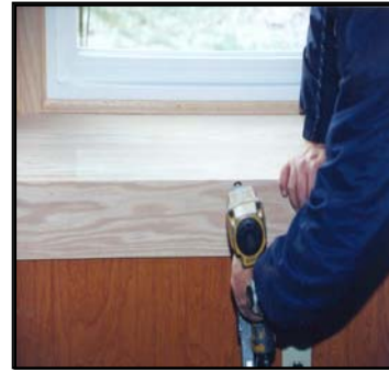
10-f: Match center lines and fasten