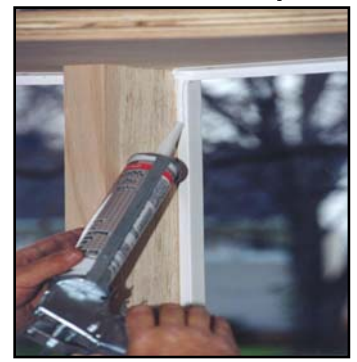
7-a: Back Seal Window Stops