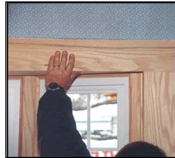
10-h: Top Face Board rests on Sides