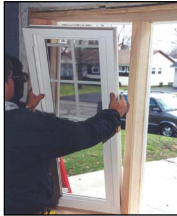
7- Install all Window Units